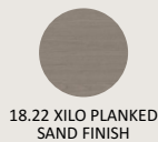
18.22 XILO PLANKED SAND FINISH