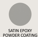
SATIN EPOXY POWDER COATING